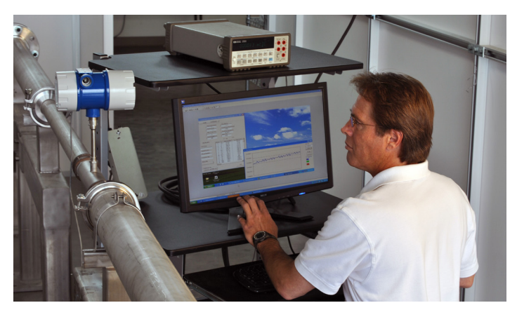
Calibration Technician performing an actual gas calibration in the flow laboratory.

The DDC-Sensor<sup>™</sup> sensor has the digital platform for greater flow meter programmability and a more robust noncantilevered RTD design..