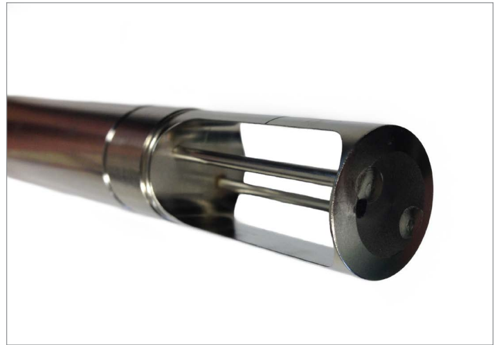
DDC-Sensor™ shown in closeup with weld mark detail on the bottom of the RTD window highlights non-cantilevered design.

Use Calibration Validation to assure the meter is functioning correctly and to produce records for regulatory compliance when needed.