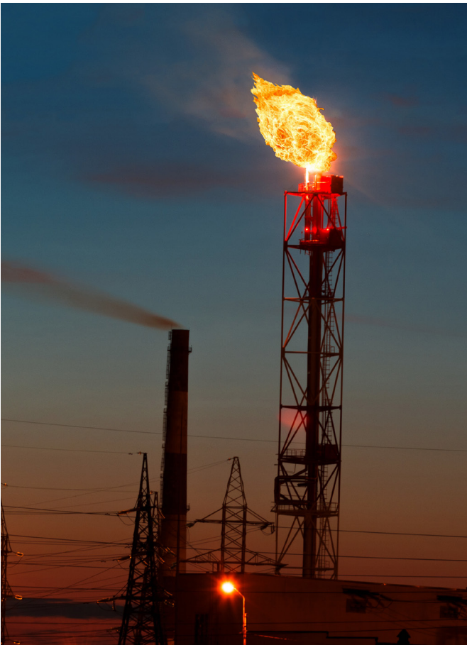
A flare burning hydrocarbons and lighting the night sky.

Fluid composition and installation anomalies can also affect