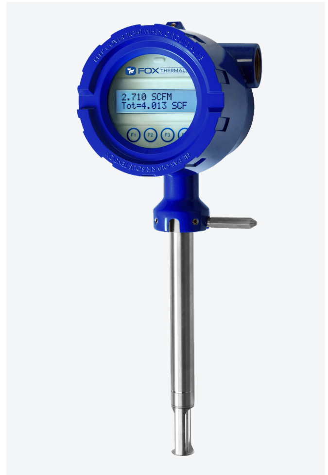
The robust features and approvals of the Fox model FT4A commonly used in Oil & Gas applications.